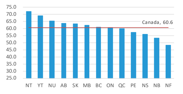
Table 2: Historical Labour Force Activity, Northwest Territories